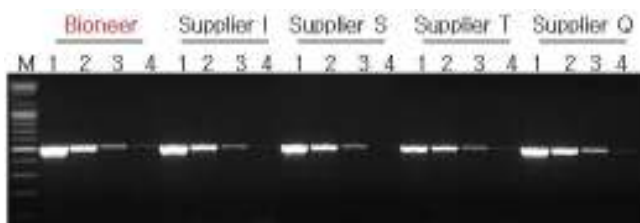
Figure 1. Comparison of PCR amplification between AccuPower® PyroHotStart Taq PCR PreMix from Bioneer and other suppliers' Hot start PCR master mix. Sensitivity test was performed by amplifying the IRGC gene from a serial dilution of human genomic DNA. This data shows that AccuPower® PyroHotStart Taq PCR PreMix has higher amplification efficiency than other suppliers' Hot start PCR master mix.

Lane M: 100 bp DNA Ladder (Bioneer, Cat. No. D-1030)