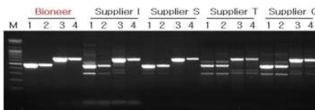
Figure 2. Comparison of PCR amplification specificity between AccuPower® PyroHotStart Taq PCR PreMix from Bioneer and other suppliers' Hot start PCR master mix. PCR reactions were performed according to each supplier's protocol. The PrP gene was amplified from human genomic DNA with two different primer sets, separately. This data shows that AccuPower® PyroHotStart Taq PCR PreMix has higher amplification efficiency and specificity than other suppliers' Hot start PCR master mix.

Lane M: 100 bp DNA Ladder (Bioneer, Cat. No. D-1030)